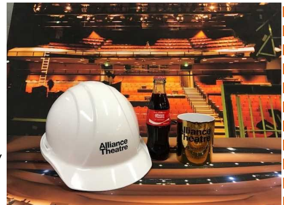
Construction is almost done. We can't wait! Can you?

Usher Website & Usher Dues: http://my.alliancetheatre.org/single/SelectSeating.aspx?p=117540