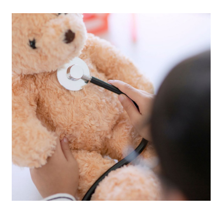
Teddy Bear Clinic: Interactive Story Time

*limited tickets available at Check In table beginning at 1 PM.